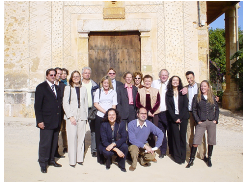
[Participants in the special activity at the "finca" (estate) Galatzó, 16 November 2006]

In 2006, within a new communication strategy, TOI started publishing quarterly newsletter and in November decided to work on a new web-site to be on line in 2007.