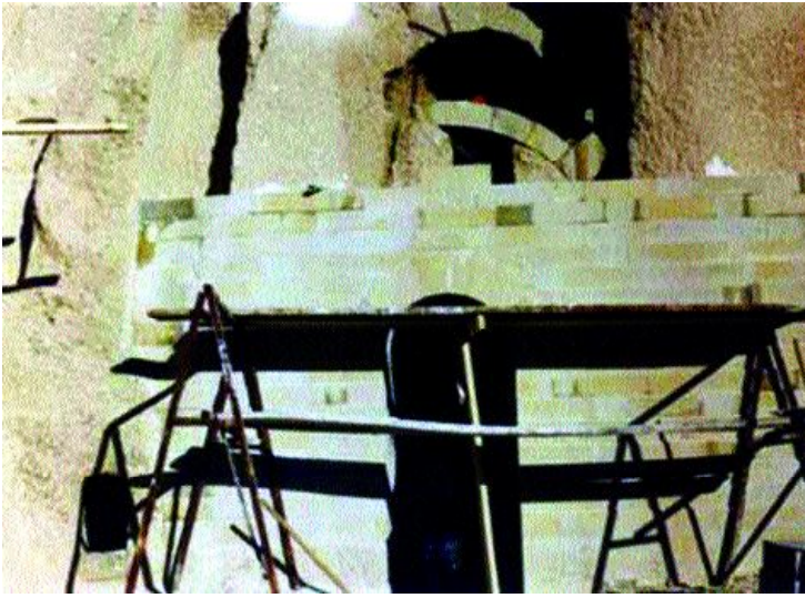
EXTERIOR VIEW OF THE SARICA CHURCH DURING RESTORATION

VASCO invested about US$150,000 in this project, including fees for all the workers, experts and architects; these funds came from VASCO's corporate budget. To help create wider support for the project, VASCO also used the name of Magic Life International, an affiliate company, which is widely known in the area.