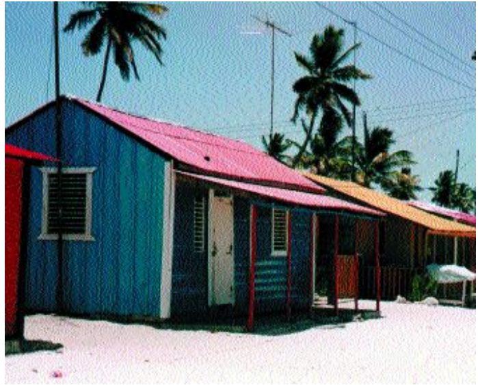
RESTORED HOUSES IN THE DOMINICAN REPUBLIC